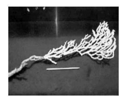
Primnoa resedaeformis (Gunnerus, 1763)

The most plentiful deep-sea coral species in Nova Scotian waters appears to be this primnoan, known locally as "sea corn" or "red trees." It is highly branched and comparable to a bush, as opposed to the tree-like bubblegum coral (Paragorgia). Fishermen report that Primnoa grows in dense patches where is has not been cleared away by nets dragged across the bottom. Each coral animal is called a "polyp." The Primnoa polyps are crowded onto the branches of the skeleton, where they feed by filtering particles out of the water flowing past. Unlike reef-forming tropical corals, deep-sea coral polyps do not form symbiotic associations with photosynthetic microorganisms. This specimen was collected off southern Nova Scotia.