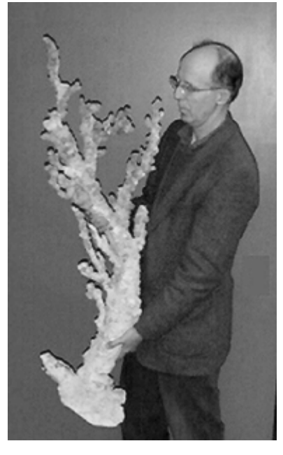
Paragorgia arborea (Linnaeus, 1758)

arborea shows the branched morphology found in many deep-sea corals. The specimen was collected from the Fundian Channel, which lies between southern Nova Scotia and Georges Bank in the Gulf of Maine, at a depth of about 200 fathoms (360 m). Paragorgia species are members of the order Gorgonacea, or "horny corals." Paragorgia species are somewhat spongy in texture when alive, unlike most of the gorgonaceans. Fishermen call this species "bubblegum tree" because it is usually orange or pink, has a lumpy surface texture, and can be as large as a small tree (5 m high or more).