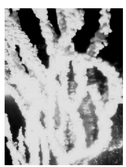
Paramuricea grandis (Verrill, 1883)

This species sometimes grows on the same skeleton as Primnoa resedaeformis. Whether they compete for space aggressively, or coexist is unclear. In this case, the Paramuricea is a small colony at the base of the coral skeleton. Local fishermen call it "black coral" because the secreted skeleton is black, as opposed to the white skeleton that appears to be secreted by Primnoa. In this specimen, the broken coral base has alternating black and white rings suggesting that Primnoa Paramuricea have alternated in occupying the niche created by the skeleton they made together. This interpretation is speculative and is an illustration of the general lack of knowledge of these beautiful but mysterious animals of the deep.