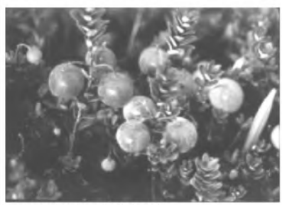
Large cranberries on Sable Island

For many of us, cranberries are associated with a thick red jelly that comes out of a can - sschlock! - at Thanksgiving and Christmas. But do we associate cranberries with Nova Scotia wetlands? This berry is native to Nova Scotia and can be found growing along the coasts of the province and in inland bogs. Cranberries often grow in tidal freshwater marshes, along wet shorelines, and on the edges of salt marshes. Another common cranberry habitat is in depressions behind beaches. When sand dunes form along beaches they can create depressions behind them that hold water, and cranberries grow well in these sandy soils.